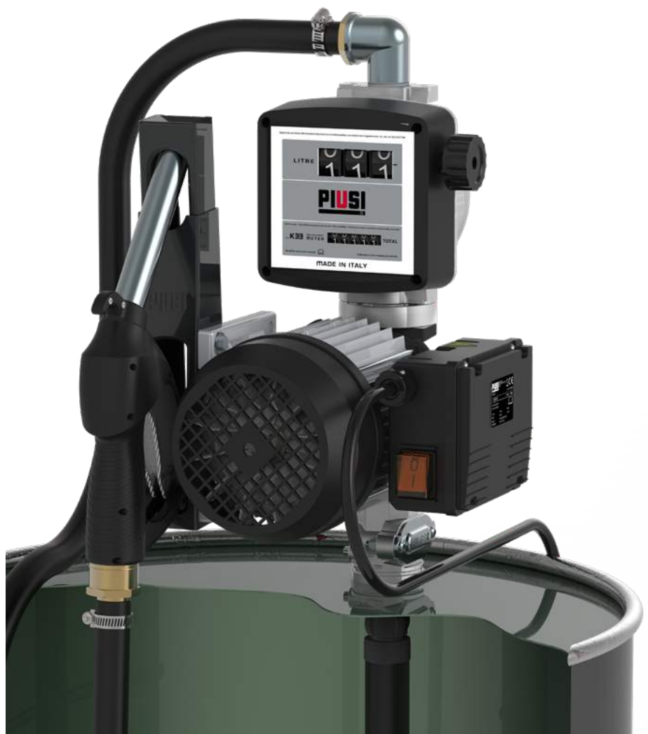
VISCOMAT VANE DRUM