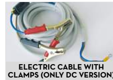
ELECTRIC CABLE WITH CLAMPS (ONLY DC VERSION)