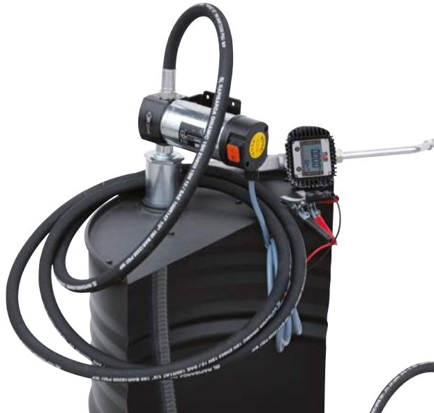
VISCOMAT GEAR DRUM DC