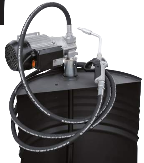
VISCOMAT GEAR DRUM AC