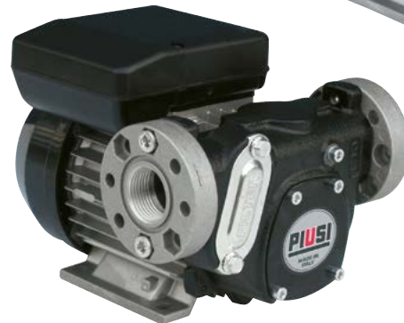
PANTHER 72 - PANTHER 90 (flanges included)