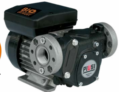
PANTHER AC BIO