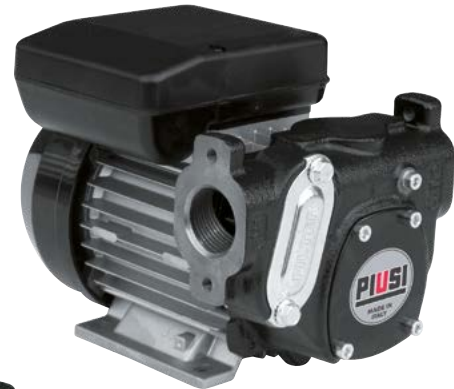
PANTHER 56 (flanges not included)