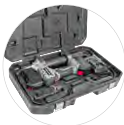
Heavy-duty carrying case with metal latches and padlock ready. Shoulder strap included.