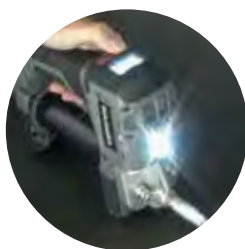
Convenient LED work light, with on/off control.