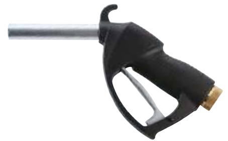
SELF 3000 DIESEL/GASOLINE