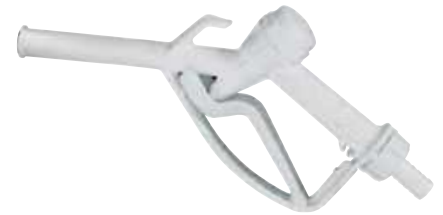
PLASTIC NOZZLE WATER/FOOD