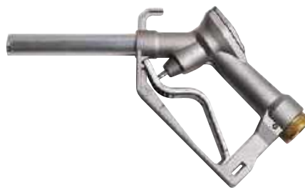
SELF 2000 DIESEL