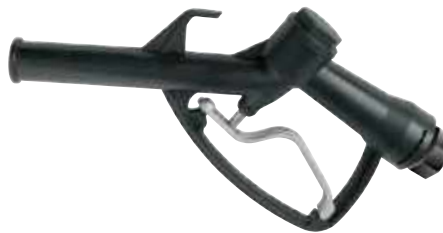
PLASTIC NOZZLE WATER/DIESEL