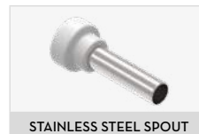
STAINLESS STEEL SPOUT