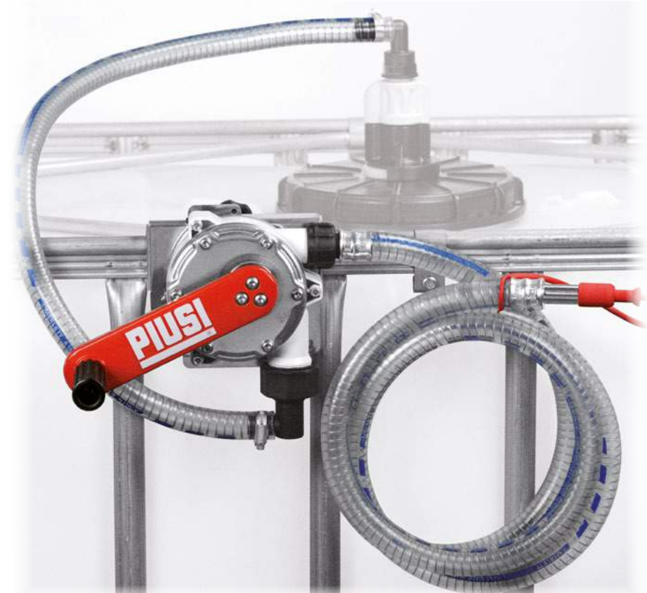
PIUSI HAND PUMP IBC

The PIUSI HAND PUMP IBC is a rotary vane pump suitable for transferring AdBlue®. It maintains all the main features of the PIUSI HAND PUMP while its ergonomic bracket guarantees a perfect IBC handling.