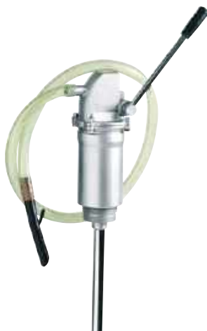
PISTON HAND PUMP