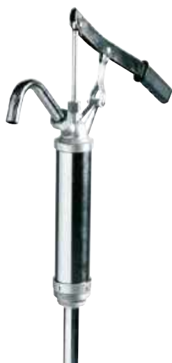
PISTON HAND PUMP