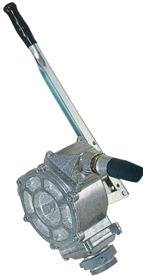
PM GPI PISTON