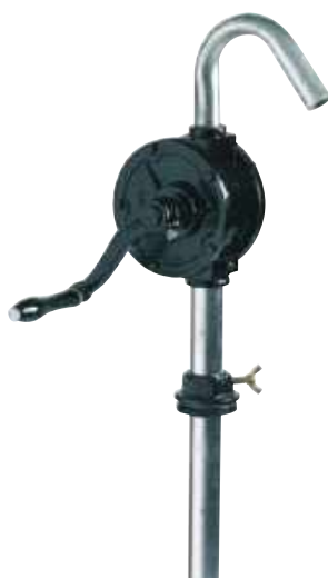
CAST IRON ROTATIVE