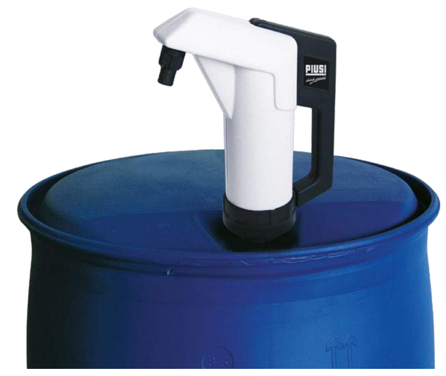
SUZZARABLUE HAND PUMP