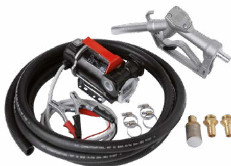
BATTERY KIT 3000 INLINE