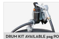
DRUM KIT AVAILABLE pag.90