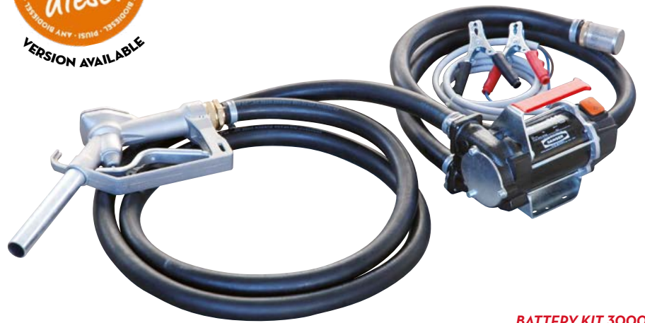
BATTERY KIT 3000