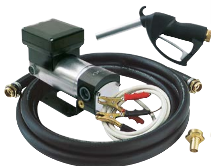
BATTERY KIT OIL