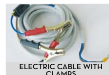
ELECTRIC CABLE WITH CLAMPS