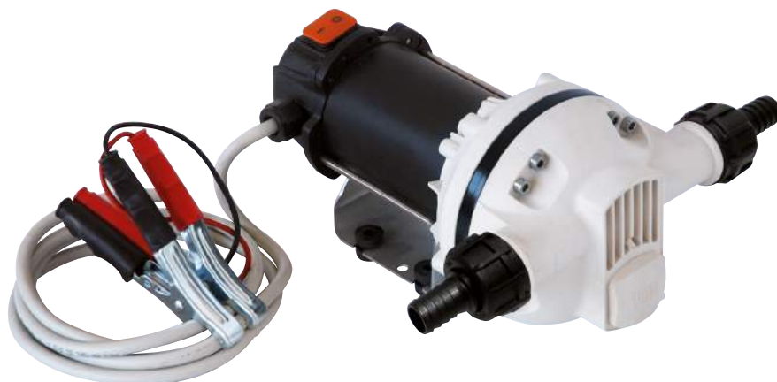
SUZZARABLUE PUMP DC