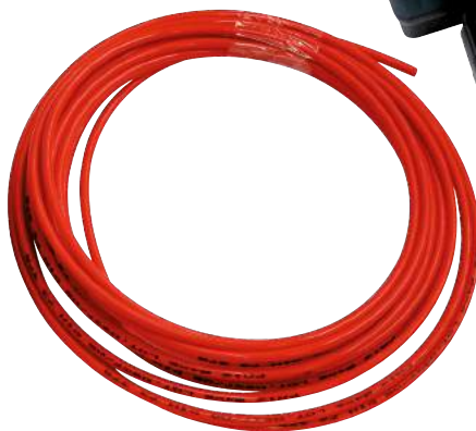
10 METERS HOSE