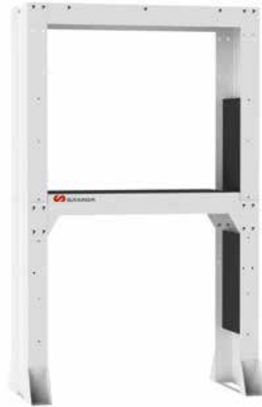
SIX HOSE REEL STAND

Very solid construction, allows mounting six RM-12 or RM-34 hose reels depending on models. Two extra reels can be mounted using the optional accessory. Six reel stands include perforated internal side panels and drip tray.