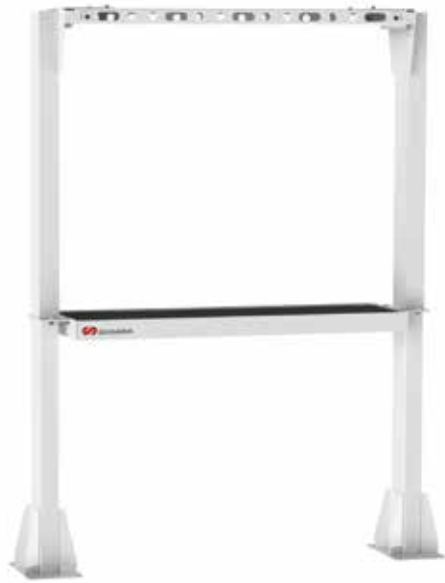
FIVE HOSE REEL STAND

360 163 Five hose reel stand For use with all RM-12 reel models, includes drip tray. Dimensions: 1.750 x 400 x 2.220 mm.