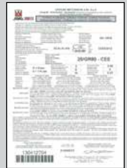
Includes callibration certificate.