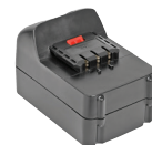
169 020 / 169 021