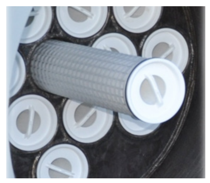
XtreamPure cartridges are easy to install and remove with no tools needed.